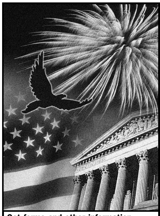
Get forms and other information faster and easier by: