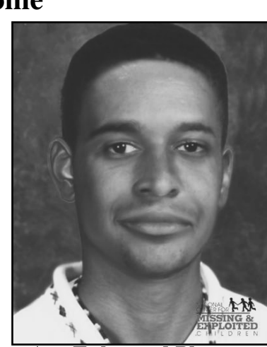
Age Enhanced Photo

Male, Age Now: 31 Ht:5'8 Wt:135 lbs. Brown eyes, Black hair