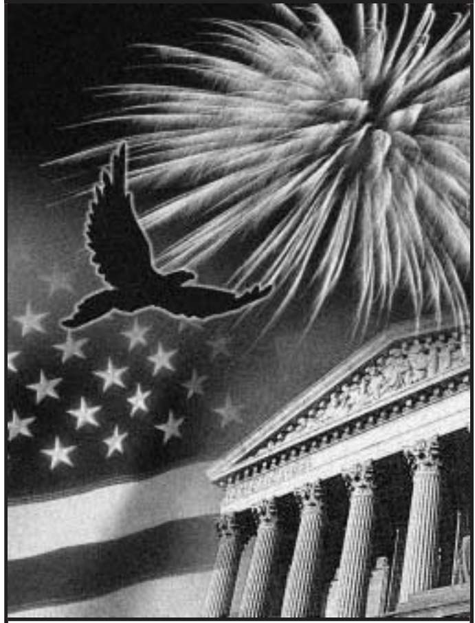
Get forms and other information faster and easier by: