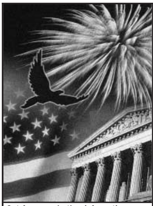
Get forms and other information faster and easier by: